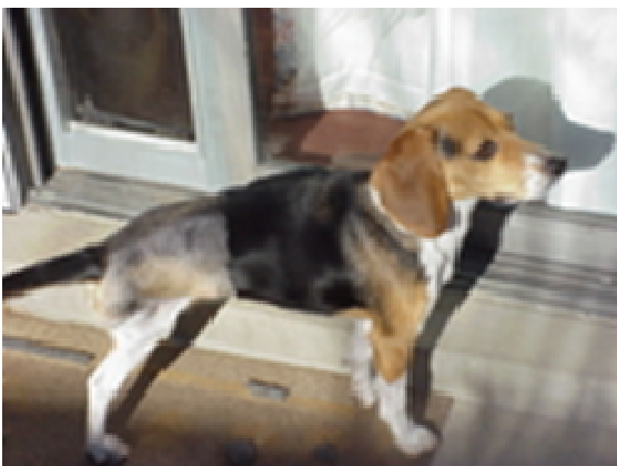
Molly, strong as all the other dogs, with 3 legs!