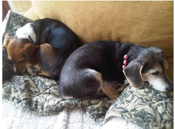
Molly (left) hanging with her brother, Patch.