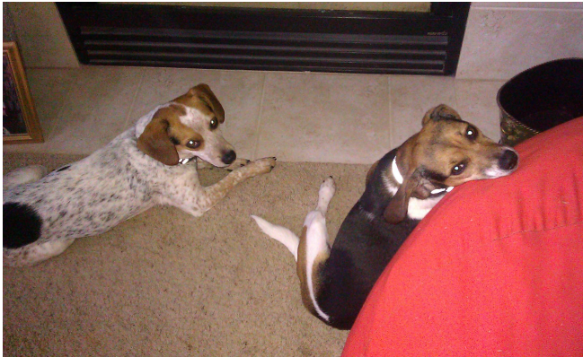
Thelma and Louise in their new and loving forever home